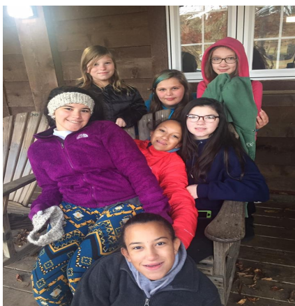
Youth Group Retreat held at Camp Loucon

The last day for after school programming in 2017 is Monday, December 18!